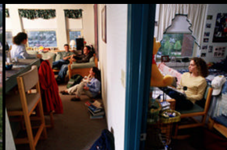
GUZMAN HALL DORM