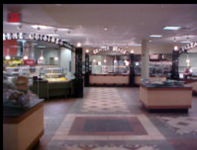
RAY DINNING HALL