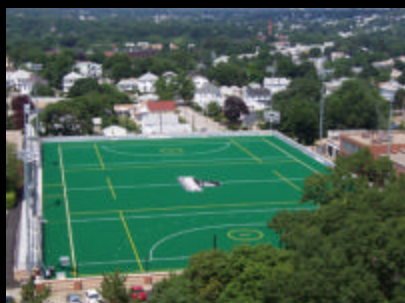
PETERSON TURF FIELD